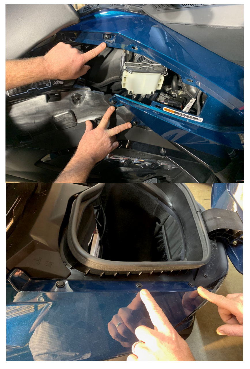
6.- Then remove the upper blue panel by pulling the panel away and sliding forward towards the front of the Spyder to release the panel.