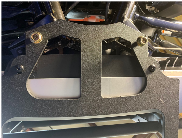
Bottom View of Your Ryker.

1.- Installing the new Ryker Bumper is simple. Only four bolts! First remove the LOWER two factory 6mm bolts that secure the front Ryker Grille. These are shown in the photo below as black bolts if you Ryker has them. Remove them to allow the Grille Guard to be installed. Next place the Bumper in front of the Grille and secure in place by using the longer 6mm Stainless Steel bolts supplied. Do not tighten at this point. If you have a Ryker Rally Edition, some units may or may not have the factory 6mm Black Bolts and U-Clips installed. If not see below on how to install the supplied bolts and clips